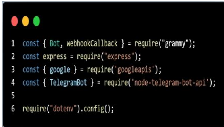
Figure 2: Core System Architecture and Coding google spreadsheet Implementation

state management. Specific functions were developed to handle user commands. The /start command functionality processes the initial user interaction, sending a welcome message and providing instructions on how to use the bot. The /Cari (Search) command functionality serves as the entry point for users to initiate a sales data search, prompting the bot to enter a search mode. An asynchronous function (async function) was implemented for user input handling and data retrieval logic, continuously listening for and processing incoming user messages. This function intelligently checks the bot's current search state and, if in search mode, attempts to retrieve relevant sales data from the linked Google Sheets based on user-provided 'Kode SF' (Sales Force Code) or 'Email'.