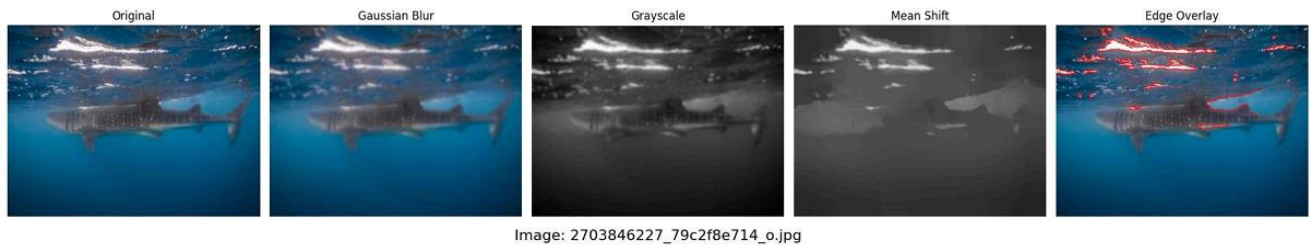
Fig. 3: Mean-shift performance in low contrast image of a whale shark

Figure 2 shows how this model performs in a higher contrast picture. It could easily detect and trace where exactly the sea slug is. It easily makes small cluster that highlight the sea slug since sea slug has very distinctive colors compared to the rest of the background which seems to be a floor of coral and small rocks.