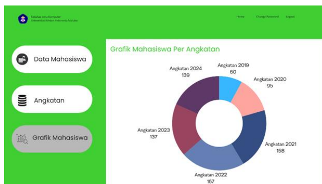
Fig 9. Student Graph