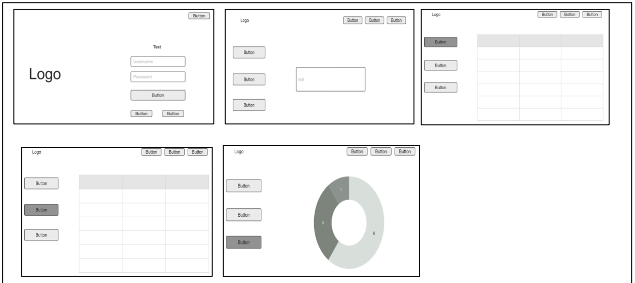
Fig 4. System Display Design

The following is the design of the system to be built. The design is shown in Fig 4.