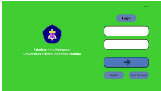
Fig 5. Login View

Users can access the system by logging in first using the username and password that has been registered beforehand. After logging in, the system will automatically log in to the homepage. The home view can be seen in Fig 6.