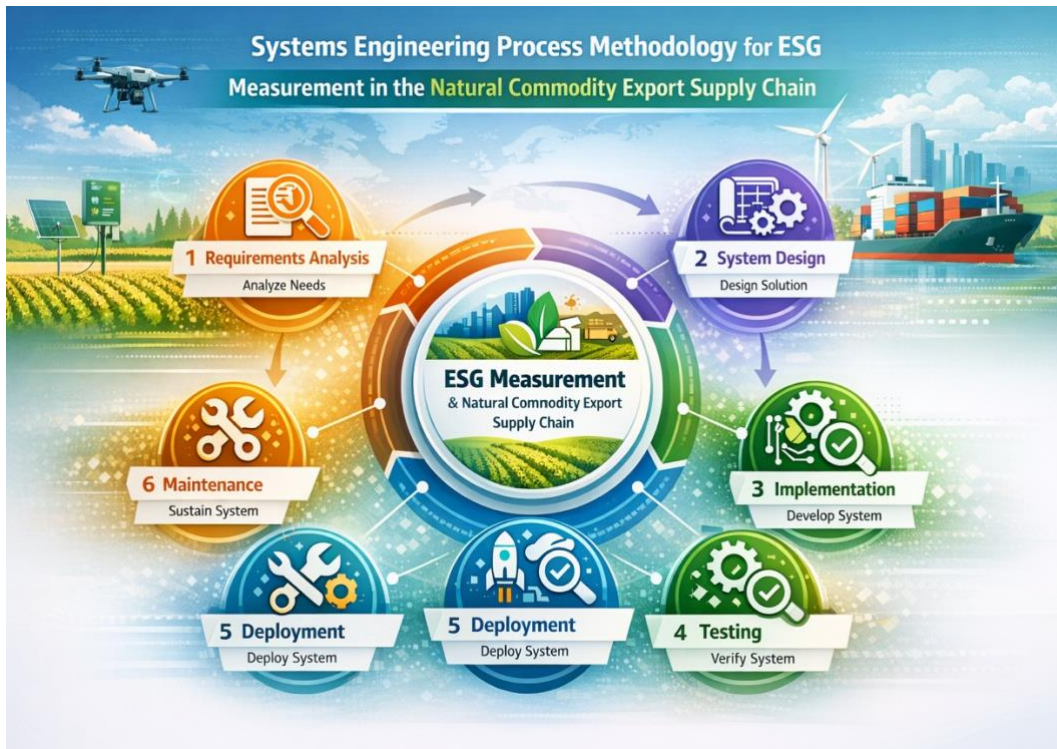
Fig 1: Systems Engineering Process (SEP) for Chain ESG Measurement Supply Export