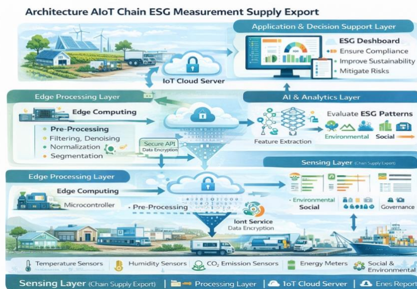
Fig 3: Architecture AIoT Chain ESG Measurement Supply Export

The final layer is the application and decision support layer, which provides ESG measurement results through an interactive, innovative dashboard and report forms. This dashboard offers real-time and periodic visualizations of ESG performance, making it useful for management, regulators, and stakeholders interested in other areas. For supporting strategic decisions, improving compliance, and repairing the sustainable supply chain of export commodities. The following is Figure 3. Architecture AIoT Chain ESG Measurement Supply Export.