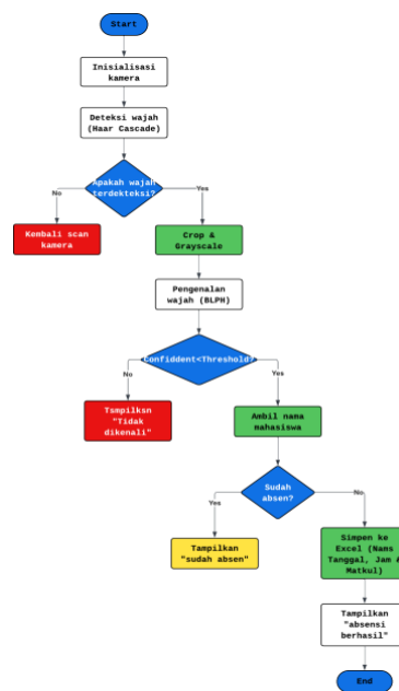
Fig.1: Flowchart of the facial recognition-based attendance verification process

The system operates through three sequential workflows: face registration, model training, and attendance verification. During registration, instructors enter student identification data (Name, Student ID) via the administrative panel, and the system automatically captures 30 cropped grayscale face samples via the webcam using Haar Cascade detection. During the training phase, the collected samples are processed by the LBPH algorithm to generate a serialized model file (trainer.yml). During attendance tracking, video frames from the student's webcam are sent to the backend, where Haar Cascade detects the face region, and the trained LBPH model calculates a confidence score. A threshold of 50 is applied: scores below 50 (converted to scores above 50) indicate a recognized student. A complete flowchart of the attendance verification process is illustrated in Figure 1.