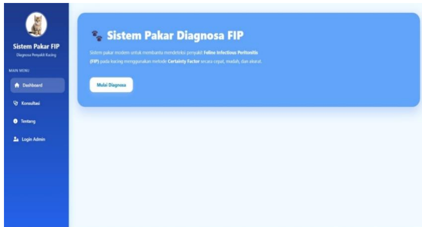
Fig.1: Home Page

This page is used by users to access information about the system and initiate the FIP disease diagnosis consultation process.