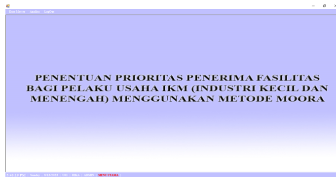
Fig. 2: Main Menu