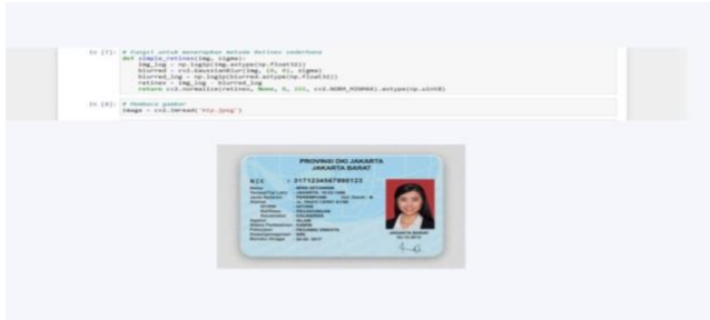
Fig 6: Retinex Original Image Display