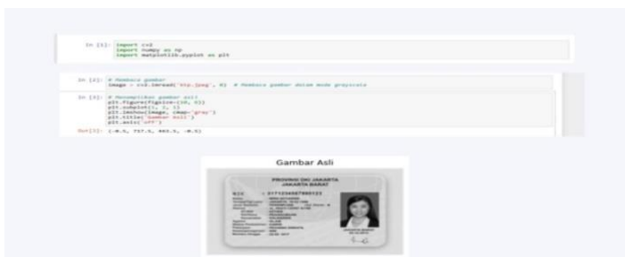
Fig. 4: Original Image Display Contrast Stretching