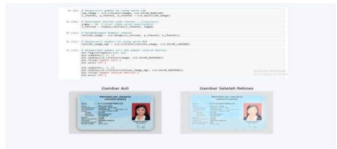
Fig. 7: Display of Contrast Stretching Result Image