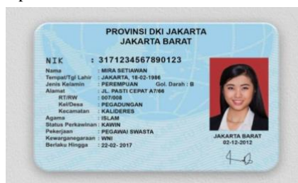
Fig. 1: Identity Card

This research uses data in the form of digital images of Identity Cards obtained through shooting using a digital camera or smartphone. This Identity Card image was chosen because KTP is one of the important identity documents that often experience image quality problems, such as low contrast and lack of sharpness.