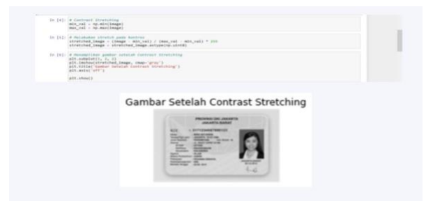
Fig. 5: Display of Contrast Stretching Result Image